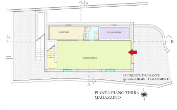
PIANTA PIANO TERRA MAGAZZINO