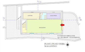
PIANTA PIANO TERRA MAGAZZINO