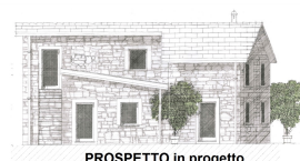
PROSPETTO in progetto