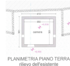
PLANIMETRIA PIANO TERRA rilievo dell'esistente