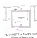
PLANIMETRIA PIANO PRIMO rilievo dell'esistente