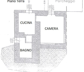
ALLOGGIO EST Piano Terra